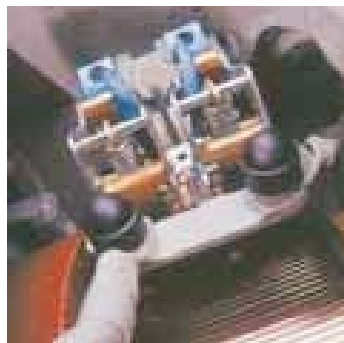
Carbonex makes 700 different design brush holders for traction vehicles for new traction motors as well as servicing and maintenance