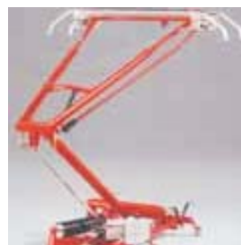
Pantograph with the highest degree of lateral rigidity, individually suspended collector strips and hydraulic frame damping