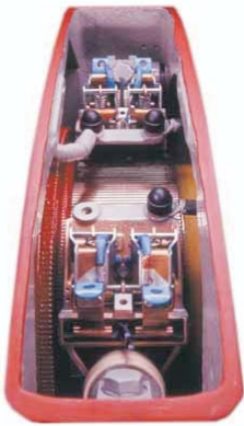
Runs like dockwork. Carbonex carbon brushes and brush holders guarantee the best electric contact, high temperature and heat shock resistance and good mechanical resistance

With Carbonex, you can be sure that you will continue to have a dependable partner and supplier at your side.