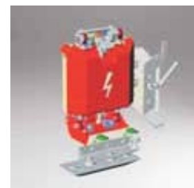
Pantograph for third rail systems, self insulated, with maintenance-free bearings