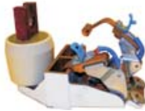
Double brush holder with finger springs. Casting brush holder with two parallel boxes, different design