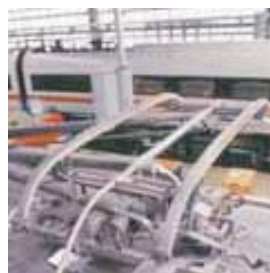
Integral collector strip with carbon coated run-off horn