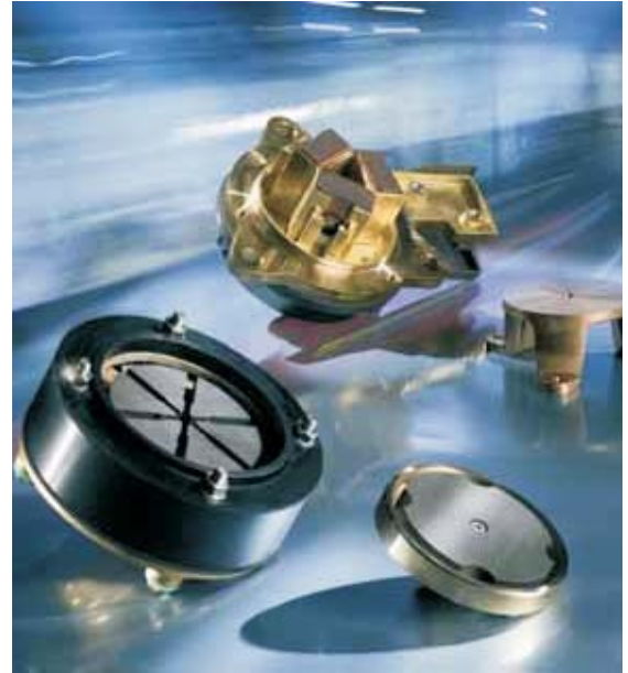
Conventional and carbon-carbon grounding contacts

CARBONEX is one of the biggest supplier of carbon collector strips using special bonding technique. All carbon collectors strips are characterized by their high degree of operational reliability outstanding temperature resistance, stable performance throughout the usable lifetime, resilience to corrosion and excellent emergency-running. Other standard features is the reliability under the extreme environmental conditions. In addition to the exceptional electrical load capacity and the long durability of our collector strips, the CARBONEX 's customers appreciate their ease of maintenance and environmental friendliness. Also we have demonstrate innovation, through the multiplex use of components, low noise sliding contacts and lead free metal impregnation.