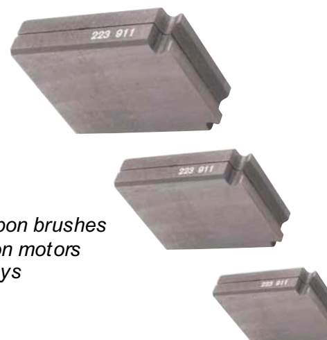
Twin carbon brushes for traction motors of Railways

CARBONEX manufactured carbon brushes for railway vehicles for several decades. Sliding contacts, in the form of carbon brushes, are an important element of current transmission. Due to their special qualities, our carbon based materials have also excelled in this area. What is particularly impressive about CARBONEX carbon brushes is their wear resiliency, their collector saving operation and their commutation properties.