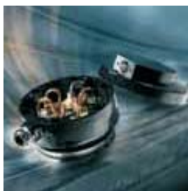
Progress and reliability: Carbonex grounding contacts